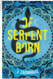
Of Serpent Born 9781857144727 • £6.99 RIGHTS: WORLD